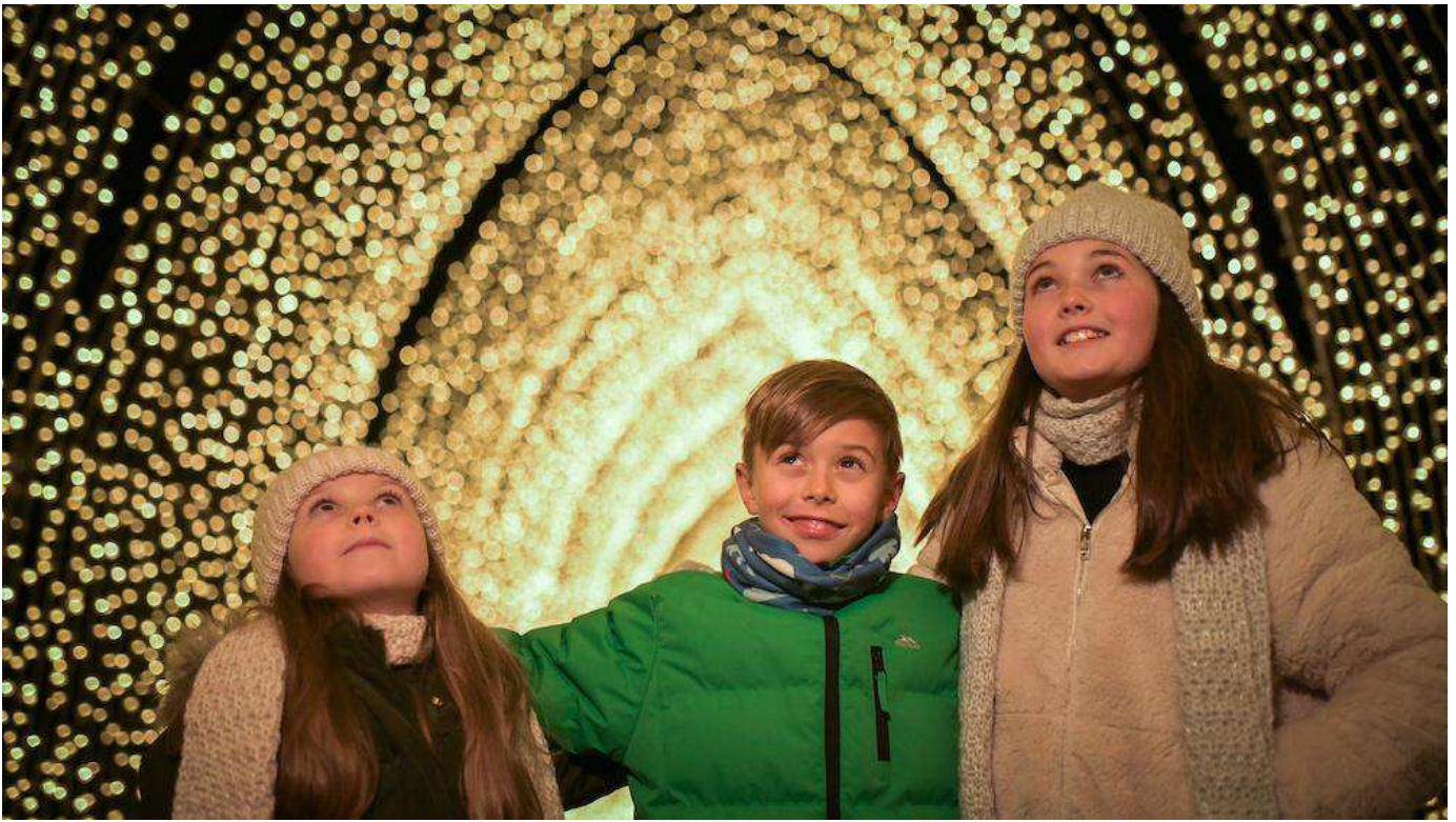
Cathedral of Light