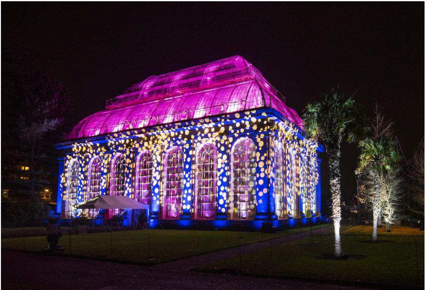
The glasshouse at the Botanics as you might not have seen it before