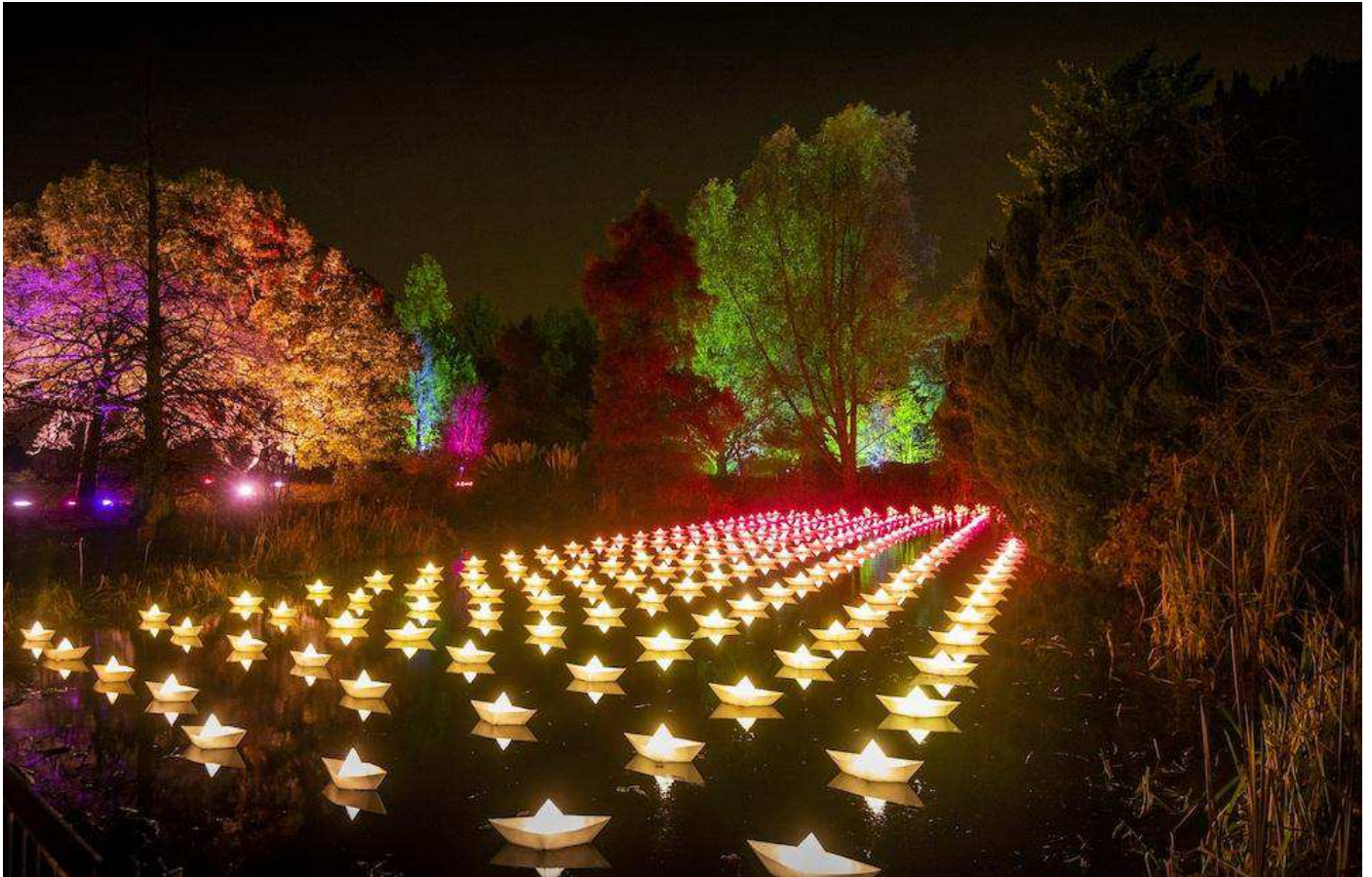
Photo by Phil Wilkinson Issued on behalf of Christmas at the Botanics. Free first use only. Images if the 2019 Christmas at the Botanics, held at the Royal Botanic Gardens Edinburgh RBGE.