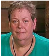
Anne Hegerty: I'm A Celebrity 2018 star's brother speaks out on...