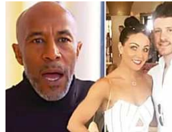
Danny John-Jules: Amy Dowden and her fiancé reveal what they...