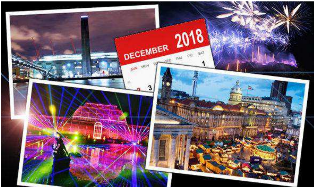
December events: The best things to do this month have been revealed by Culture Trip

December 2018 events: Best things to do this month from a Christmas market to Christmas lights and more