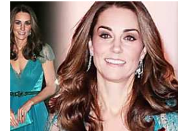
Kate Middleton nods to Queen after it is revealed why Meghan...