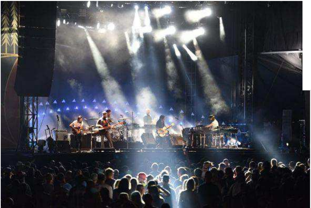
December events: US band The War On Drugs perform their only UK headline show this month