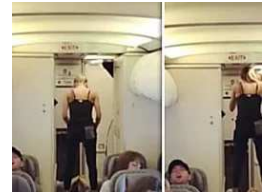
Viral PLANE video: Passenger shocked to see this happening near...