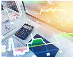
REVEALED: The SIX signs the world is heading for the next global...