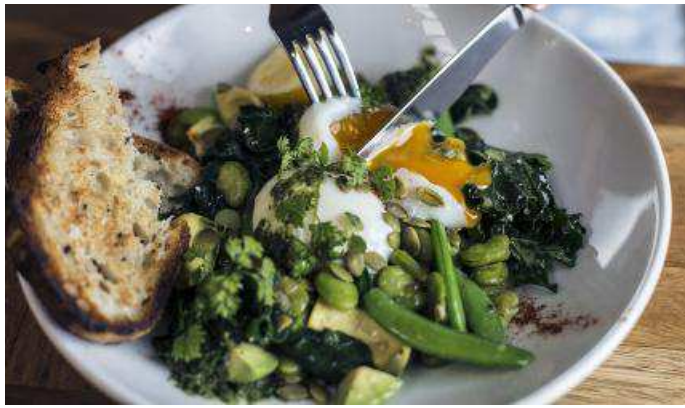
Roastville Coffee CAFE

Get the best of Broadsheet straight to your inbox