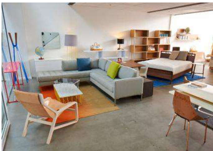
Blu Dot SHOP