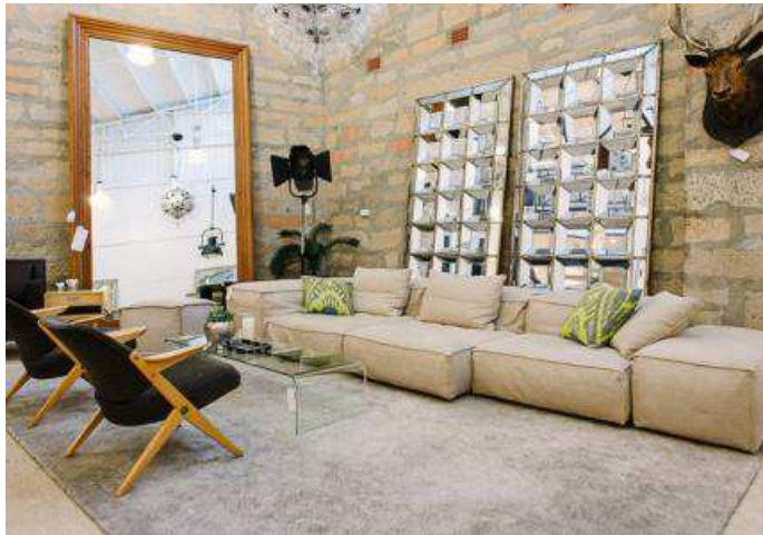
Home Furniture On Consignment SHOP