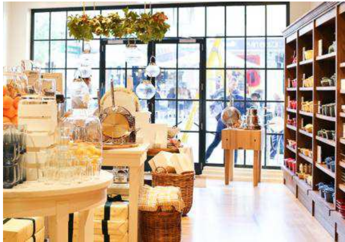
Williams-Sonoma Inc. SHOP