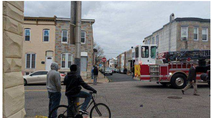
4 SHOT, 1 DAY| 1 dead, 1 critical in double shooting in East Baltimore (/news/local/gallery/breaking-news-double-shooting-in-east-baltimore)