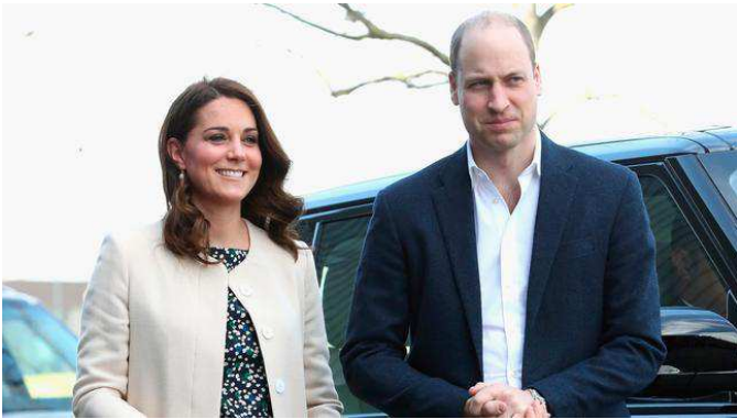
Royal baby: It's a boy for Kate on England's national day (/news/entertainment/gallery/britains-duchess-of-cambridge-in-labor-with-3rd-child-04-23-2018)