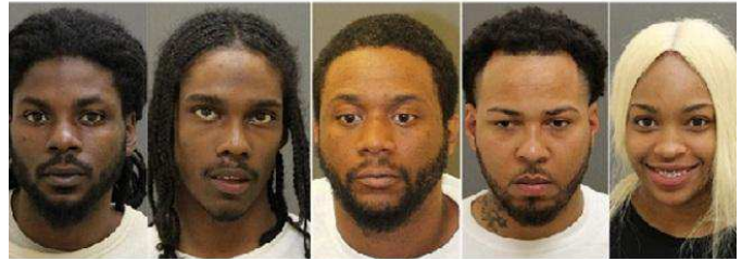
FIVE ARRESTED| East Baltimore Shootout (/news/local/gallery/five-arrested-east-baltimore-shootout)