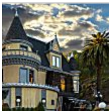
Behind the scenes at Hollywood's Magic Castle