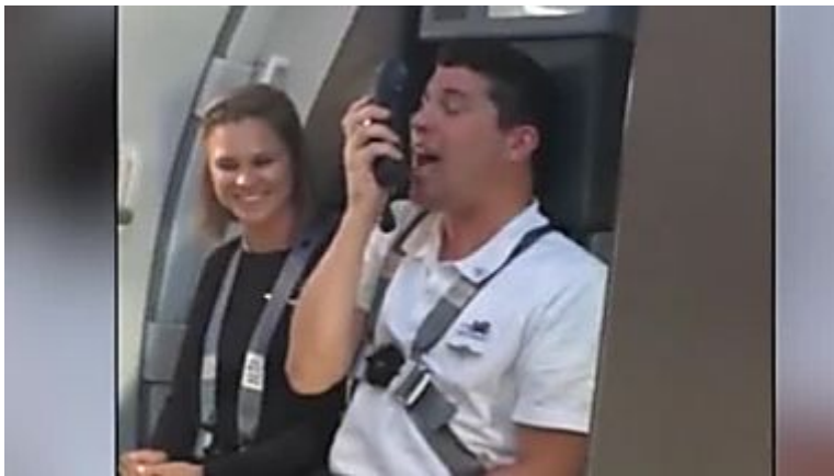
Flight attendant's 'Looney Tunes' instructions