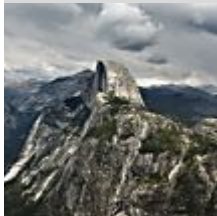
Yosemite National Park to expand by 400 acres