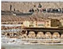
Inside Iran's museum to its wartime past