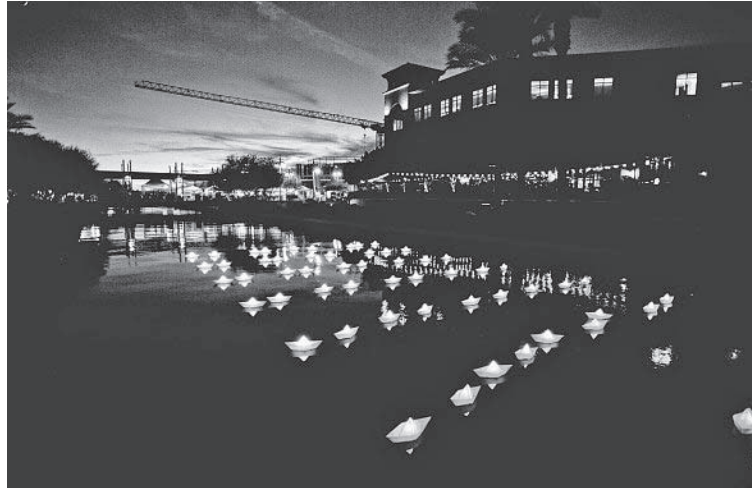
“Voyage,” which is composed of 300 lighted vessels, is designed to evoke childhood memories and imagination.