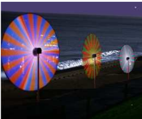
Aether &amp; Hemera's "Rainbow Glowing Wheels"