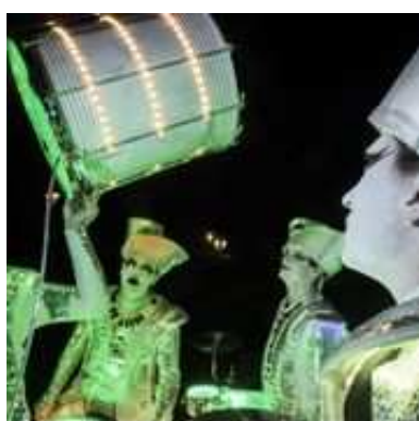
Worldbeaters Music's "Spark!".